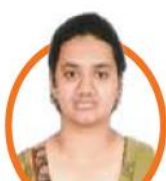
H S BHAVANA AIR 55