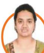
H S BHAVANA AIR 55