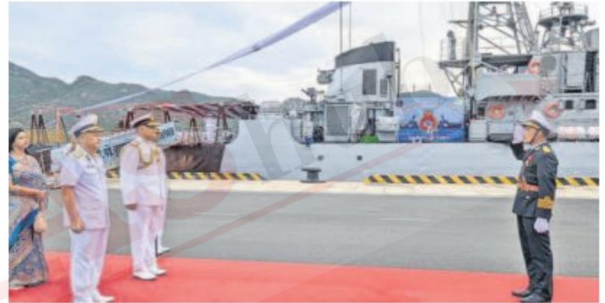
This is the first time India has handed over a full operational corvette to a foreign country.

Context: In the first-ever instance of India offering a fully operational missile corvette to Vietnam, the Navy decommissioned INS Kirpan and handed it over to Vietnam People's Navy (VPN) - reflecting the growing defence ties and strategic partnership between New Delhi and Hanoi.