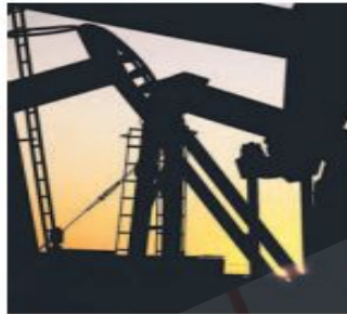
India has been mobilising new suppliers of energy.

Talks on possible Indian involvement in the lucrative Starbroeck offshore oil block