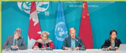
Officials at the United Nations Biodiversity Conference (COP15) in Montreal.

Reduce harmful subsidies: Identify, and eliminate incentives harmful for biodiversity