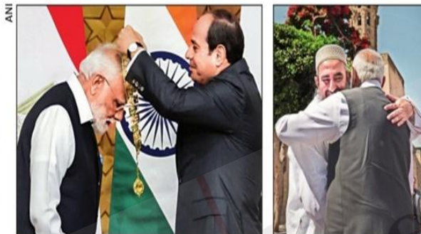
Egyptian Prez Abdel Fattah el-Sisi conferring the country's highest state honour, 'the Order of the Nile', on PM Modi in Cairo on Sunday; Modi visiting the Al-Hakim Mosque (right)