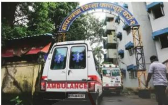
The jail in Byculla where the undertrial was a guard. File

guard at Byculla women's jail, and five others are facing trial in connection with the custodial death of an inmate in the jail on June 23, 2017.