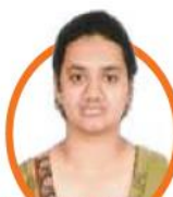
H S BHAVANA AIR 55